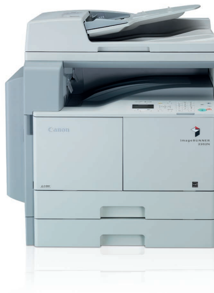
imageRUNNER 2202N with optional DADF and optional paper cassette

Compact and efficient, A3 black and white multifunctional – optimised for small workgroups.